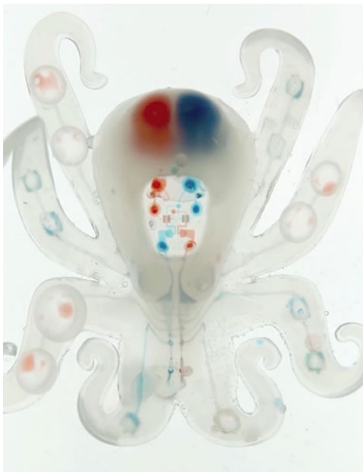
This squishy octopus-shaped machine is one example from the growing field of soft robotics. The Octobot described today is the first self-contained robot made exclusively of soft, flexible parts.