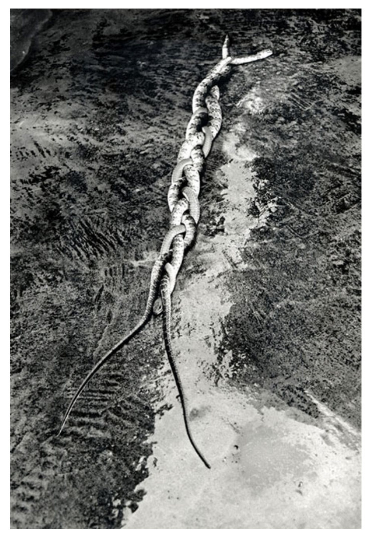
Tunga, From the series Vanguarda Viperina , 1985. Black and white photograph.

the ancient Greeks and subsequent Eurocultures in their refiguring the urgencies of our times in the post-Eurocentric conference "The Thousand Names of Gaia."34 Names, not faces, not morphs of the same, something else, a thousand somethings else, still telling of linked ongoing generative and destructive worlding and reworlding in this age of the Earth. We need another figure, a thousand names of something else, to erupt out of the Anthropocene into another, big-enough story. Bitten in a California redwood forest by spidery Pimoa chthulhu, I want to propose snaky Medusa and the many unfinished worldings of her antecedents, affiliates, and descendants. Perhaps Medusa, the only mortal Gorgon, can bring us into the holobiomes of Terrapolis and heighten our chances for dashing the twenty-first-century ships of the Heroes on a living coral reef instead of allowing them to suck the last drop of fossil flesh out of dead rock.