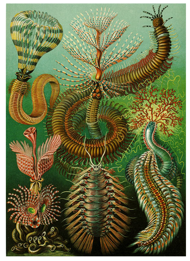
A depiction of invertebrates by German biologist Ernst Haeckel, published as lithographic and halftone prints in Art Forms in Nature (1899).