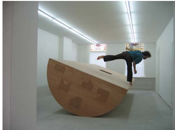
1 KIND - 2007, performative installation at West

Solo exhibition including new work: December 15 — January 25, 2014